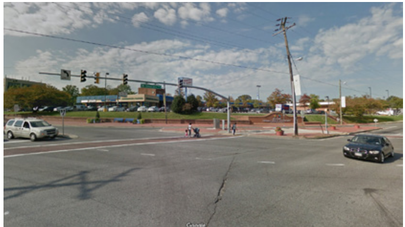
Residents cross New Hampshire Ave. at University Blvd.

Adjacent to Washington, DC's northeast border lies the city of Takoma Park, a multi-ethnic community bounded on the east by New Hampshire Avenue, a six-lane state highway and heavily trafficked artery. Developed in the 1940s and 50s to to prioritize vehicular commuting traffic over pedestrians, it poses an obstacle to social connection and is dangerous for those who walk along it or cross it. In the last decade, a large number of new residents from India, El Salvador, China, Ethiopia, and other countries have moved to the corridor and opened small businesses along the avenue.