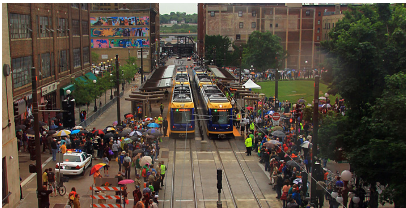
Opening day on the Green Line.

As with many of their successful projects, Springboard published a toolkit for communities who want guidance on running a similar program during construction. Irrigate has also been featured on ArtPlace's website, 3 in a documentary video 4 , and in T4A's Scenic Route Guide. 5