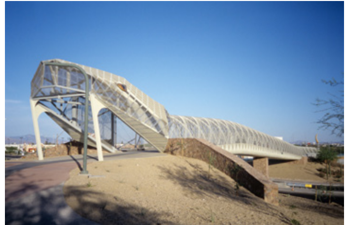
Diamondback Bridge in Tucson.