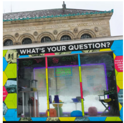
Questions asked by citizens as part of GoBoston 2030.

A similar process characterized the City of Boston's GoBoston 2030 transportation planning community engagement initiative, which featured a public Visioning Lab. 1 This space for Bostonians to share their ideas about the future of transportation in the city relied deeply on the arts. Posters helped illustrate key transportation data. Music, dancing, and visual arts served as integral elements of the central Visioning Lab event to encourage new ideas and collaboration. Prior to the Visioning Lab, locals were invited to upload photos depicting a better transportation future in the form of sketches, renderings, and found images. The feedback gathered from the theme walls informed the goals of GoBoston 2030.