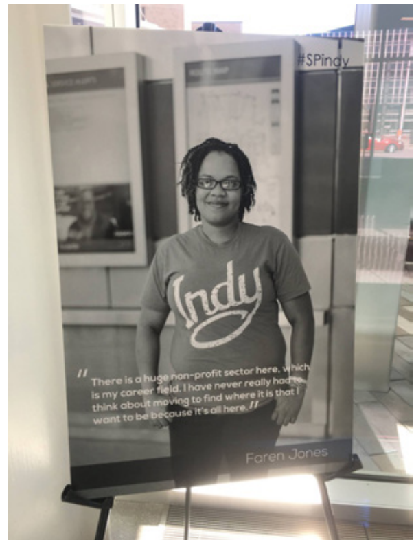
From Moving Stories in Indianapolis.