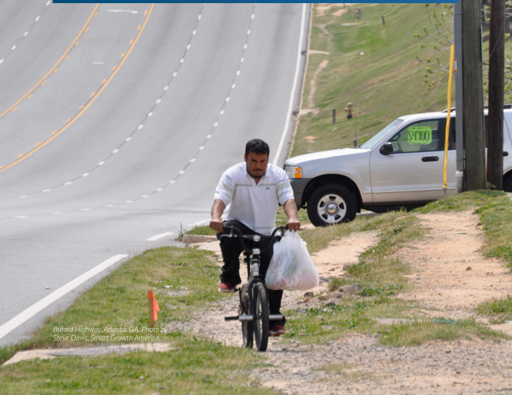
Buford Highway, Atlanta, GA.