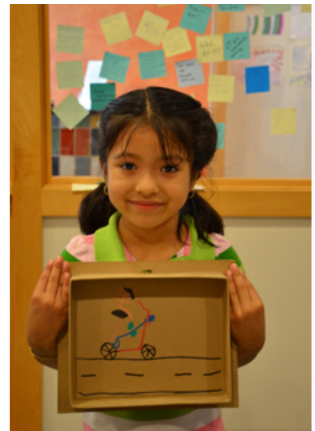
From an Envision Nolensville Pike event.

Led by trusted community organization Conexión Américas, community members of different ages and backgrounds worked together to design and build a temporary bus shelter to test ideas and start a conversation about improving transportation infrastructure, produce an oral history project in which high school students interviewed longtime residents about their memories and experiences with transportation, and run a month-long series of Creative Labs at which community members discussed, in culturally-specific settings, the assets and shortcomings of the Nolensville Pike corridor. These three projects are detailed in Envision Nolensville Pike , a plan for the arts-driven plan calling for the equitable redevelopment of the corridor's transportation infrastructure. 1