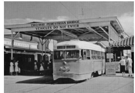
Historical photograph, courtesy of Peter Svarzbein.

The project began with a series of wheatpaste posters advertising the return of the El Paso-Juárez streetcar, and continued with the deployment of Alex the Trolley