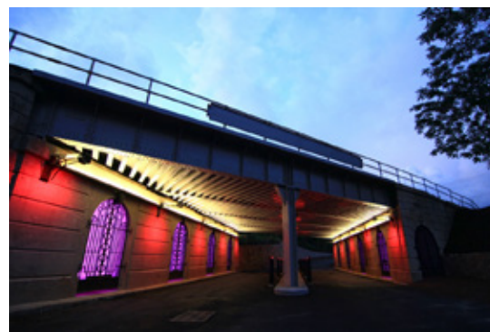
One of the underpasses in Greensboro's Over.Under.Pass project.

Greensboro, NC followed a similar path to reconnect neighborhoods to downtown. Formed in 2001 in response to Greensboro's faltering economy, Action Greensboro developed Over.Under.Pass in 2012 as a creative means of reclaiming an abandoned railroad underpass to provide a safe and enticing connection between historically African American neighborhoods in south Greensboro and the employment and cultural hub of downtown. The project succeeded by enlisting