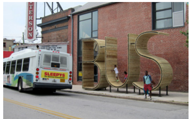
The Transit project

In Baltimore, the Transit project sought to expand local ownership over two elements of transportation infrastructure: bus shelters in southeast Baltimore and the Penn Station plaza, the space outside Baltimore's main transportation hub, in central Baltimore. Southeast Baltimore has undergone major demographic changes, with an influx of primarily Latinx immigrants. In an attempt to creatively build connections between new residents, older residents, and the bus system which is heavily used by both groups, a team led by the Creative Alliance and Spanish artists mmm... created and built