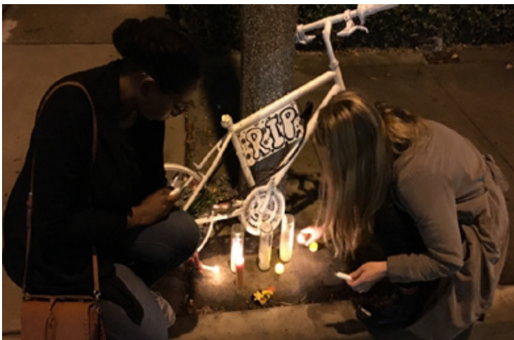
A ghost bike memorial in LA.