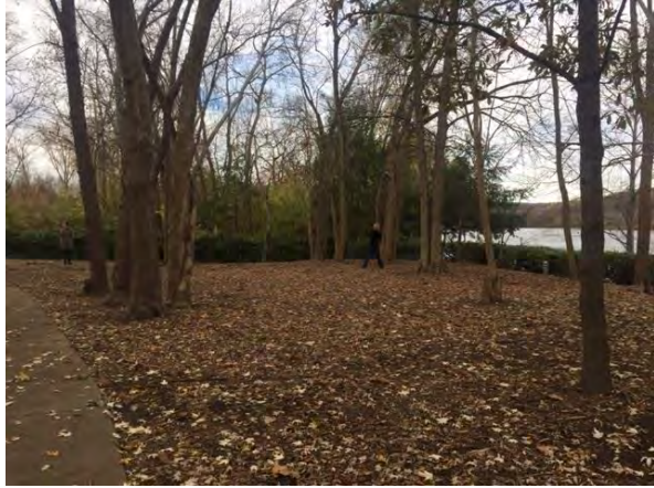
Site option 1 (wooded area)