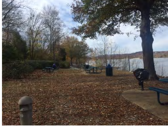
Site option 2 (riverfront site)