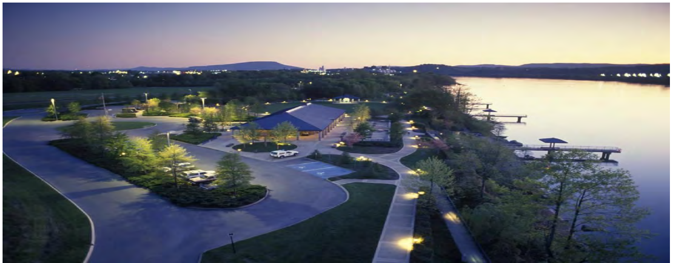
Hamilton County TN Riverpark